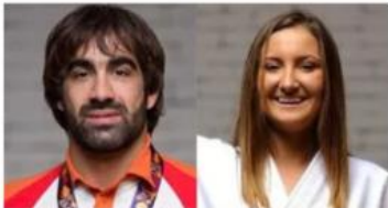
Basel Open Masters 2017