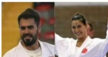
Basel Open Masters 2010