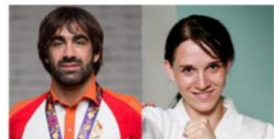
Basel Masters 2007