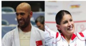
Basel Open Masters 2013