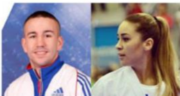
Basel Open Masters 2011