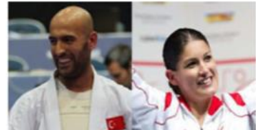
Basel Open Masters 2015