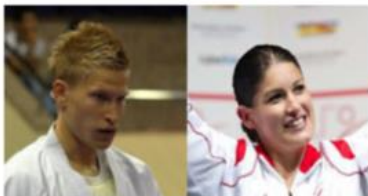
Basel Open Masters 2014