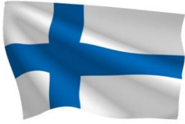
HELSINKI – FINLAND