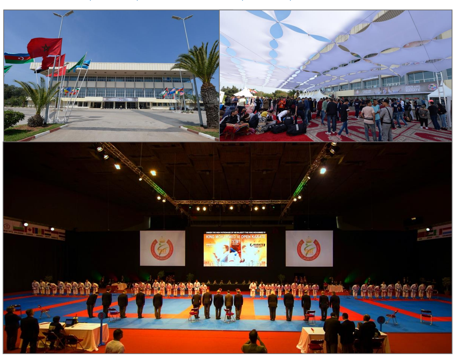
This Karate 1 – Premier League will be performed on TATAMIX srlcr tatami, WKF Approved.

Web: <a href="http://www.cspma.ma/nos-installations/palais-des-sports/">http://www.cspma.ma/nos-installations/palais-des-sports/</a>