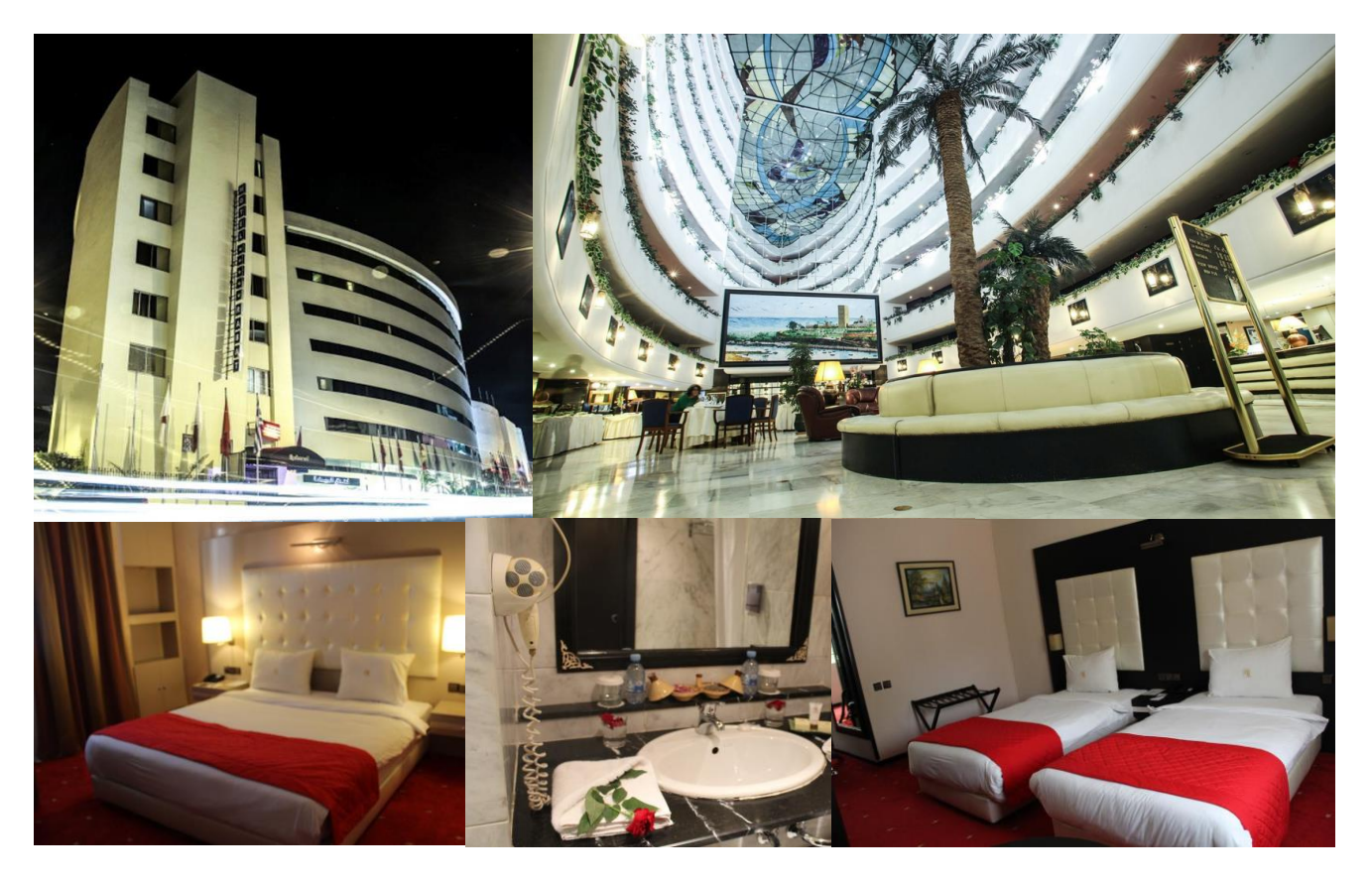
Ibis Hotel ★★★☆☆