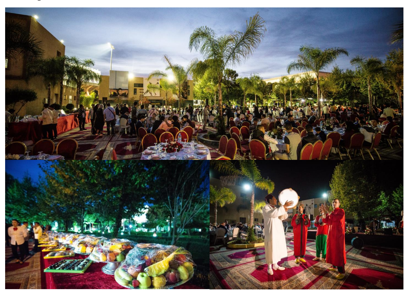
Memory of Gala Dinner Rabat K 1 Premier League 2017 in our National Karate Center

The last day to get the tickets for both events is Thursday 05th April at the official registration.