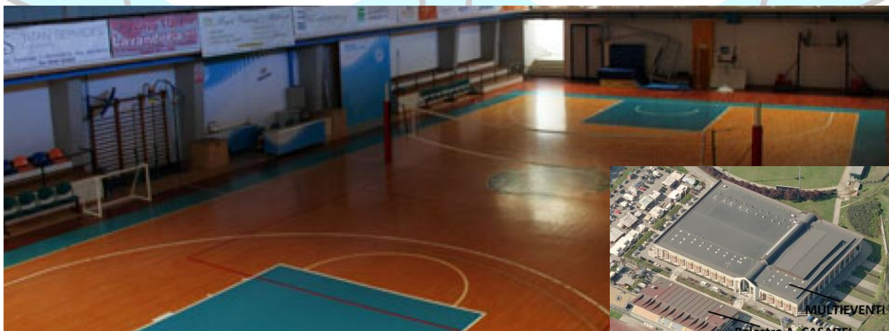
Palestra A. CASADEI

Via Rancaglia, 30 - 47899 Serravalle D-2 Repubblica di San Marino