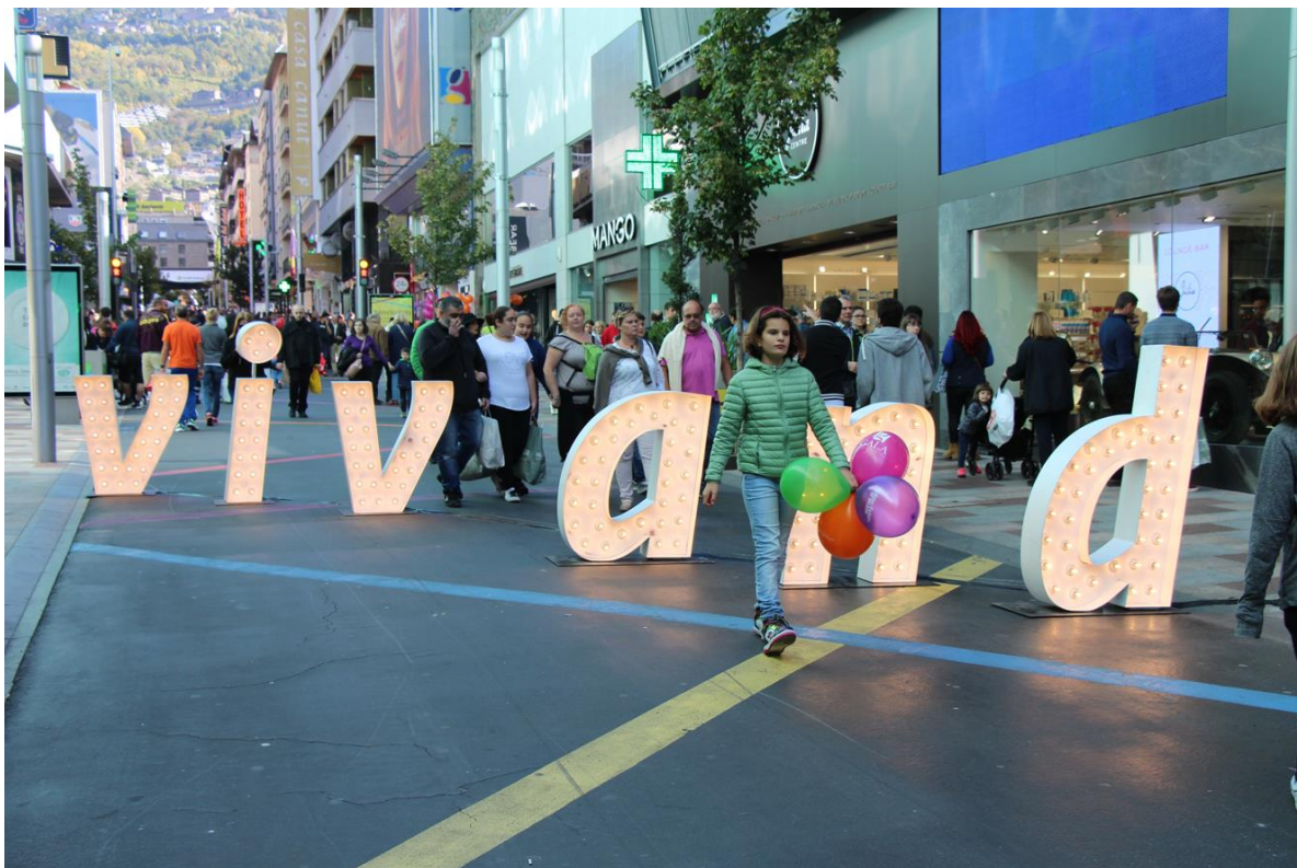
Vivand Shopping Area near PRAT GRAN ARENA