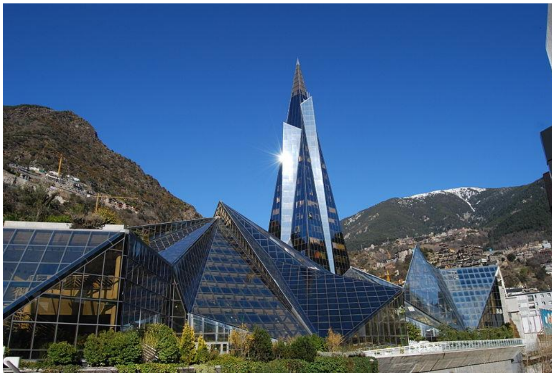
Caldea, the biggest Thermal Center in Europe near PRAT GRAN ARENA

This process culminated on 14 June 1978, when the Escaldes-Engordany parish was created. Its evolution is closely linked to the use of hot water and the construction of the first spa hotels and lately with the progressive growth of commercial tourism.