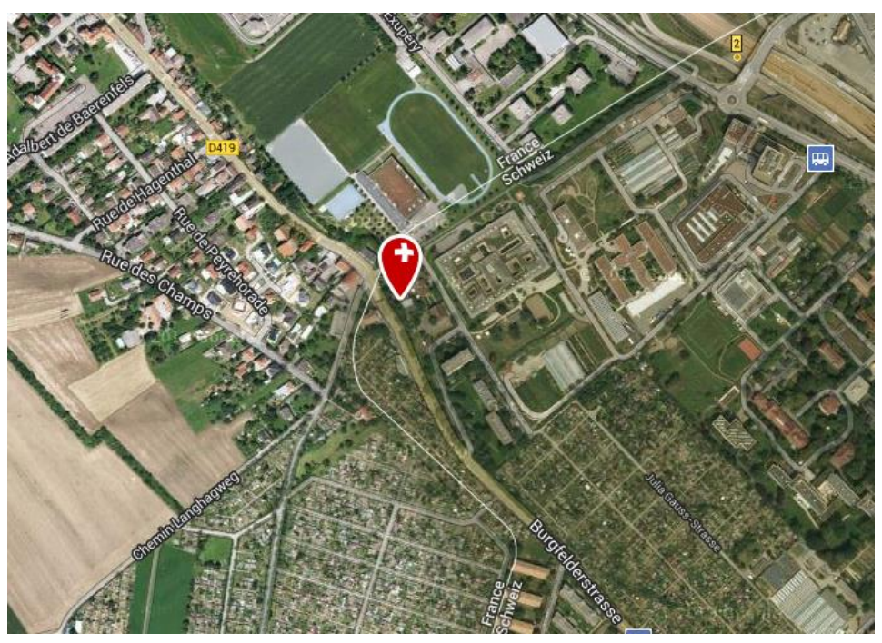
Burgfelderhof 60B 4055 Basel