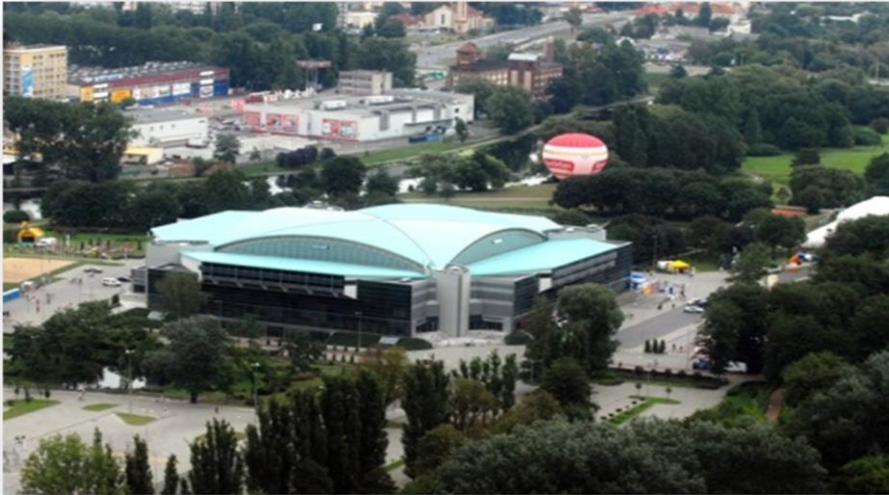
Sporthall 'Luczniczka' Bydgoszcz strett Toruńska 59