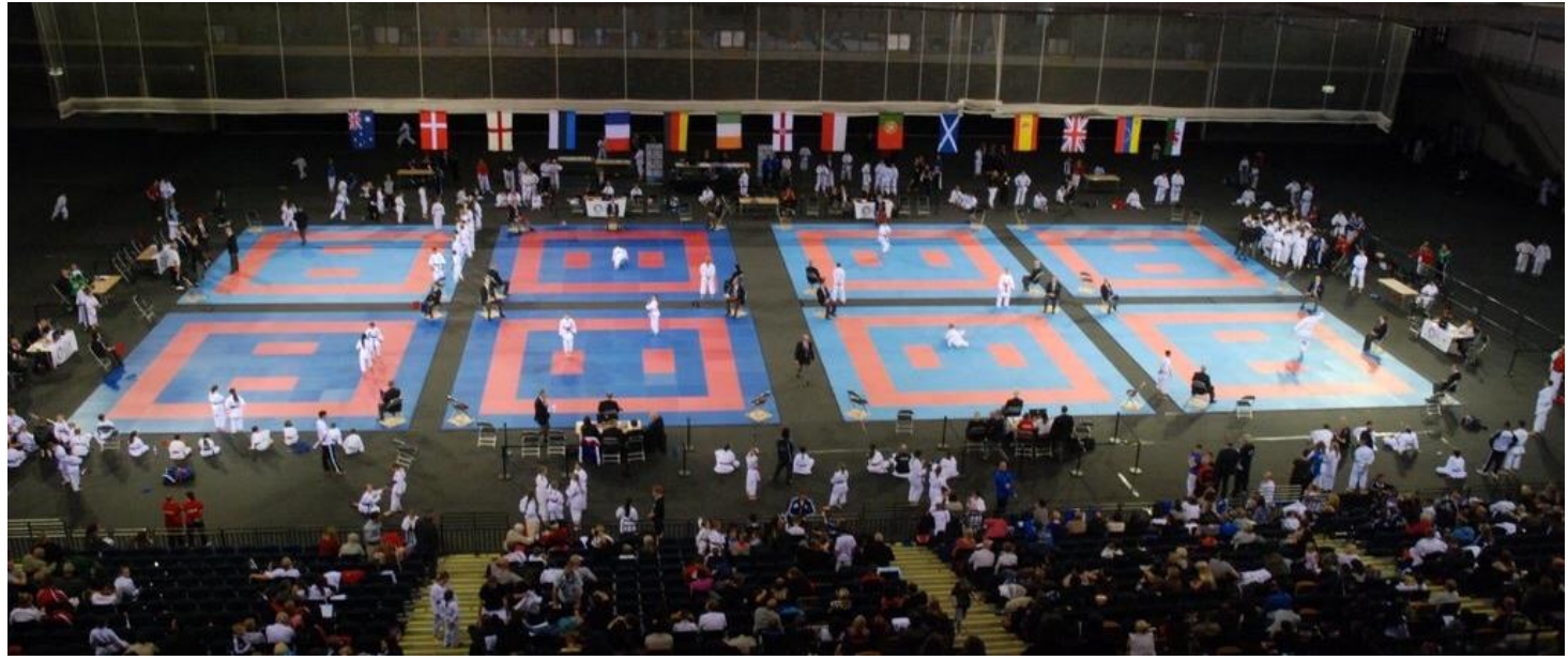
BKF at GLASGOW EMIRATES ARENA

Contact: Bobby Morton Email: <u>robert.w.morton@btinternet.com</u> Tel: (0044) 01294 602 819 Mobile: (0044) 07825 501 350