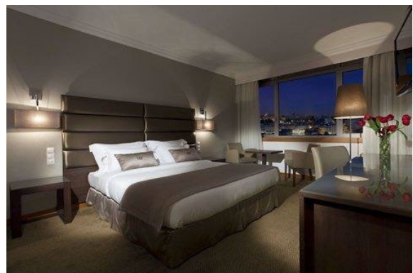
Single/Twin Executive - 71€/night