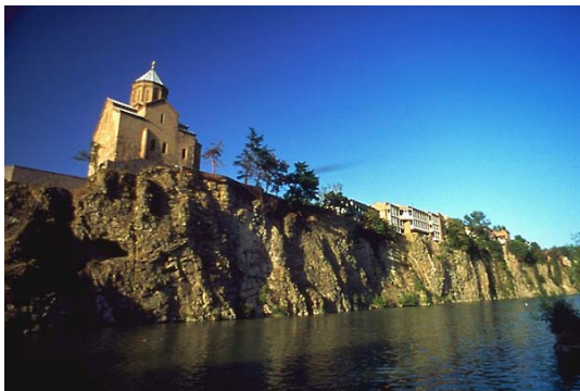
Metechi Church on the Mktvari River