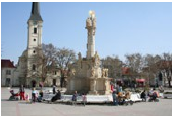
The main square with Catholic Church in 2012

The town of Nové Zámky was mentioned for the first time in 1545 as a defense stronghold against Turkish raids. The original rectangular layout was with four auricle bastions. Several years later a new castle was built on the opposite bank of the river Nitra – the present name of the town is derived from the castle. The castle known also as Castrum Novum was built in the regular hexagonal star-like layout. It had six multifloor bastions from which only the names have been preserved – Žerotin's, Fridrich's, Caesar's, Czech, Ernest's, and Forgach's. In the dramatic struggle between the Habsburgs and Turks the castle got into hand of Turks in 1663 who cruelly ruled there until 1685, when the territory of the town was conquered back by the army of Carl of Lotharingie. In 1691 Esztergom Archbishop Gyorgy Szécsényi issued the document granting town's and other important privileges to Nove Zámky. Only a few monuments and buildings of this history have been preserved, though, as most of them were destroyed during the 2 nd World War between 1944 and 1945 due to three bomb-attacks. After the 2 nd World War the town was newly rebuilt. But in spite of it in the district museum Roman inscription plates and other documents about the first settlements in the town can be found.