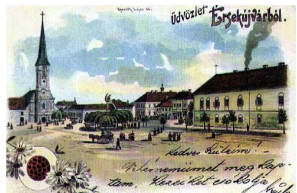
The main square with Catholic Church in 1899