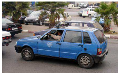
Petit taxi bleu