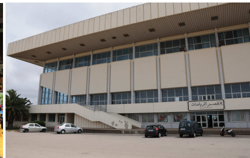
The interior and exterior view of the Complex Prince My Abdallah Rabat

Moroccan Royal Federation of Karate and Associated Disciplines