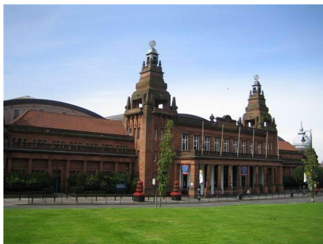
Kelvinhall International Arena