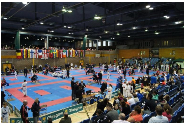
BKF Open 2011

Full details of the location of the venue are contained further down in this venue.